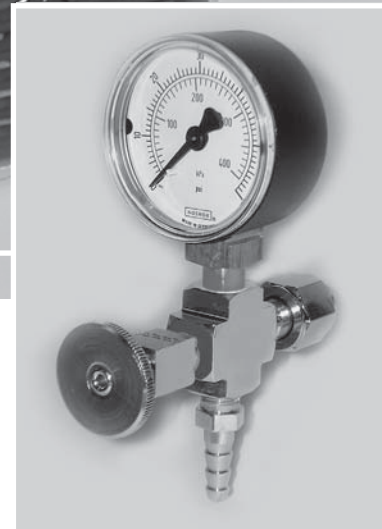
No. 184 Gauge, Valve, Outlet

Mada's MadaMist 50 is designed to drive humidifiers, nebulizers, and mist tents.